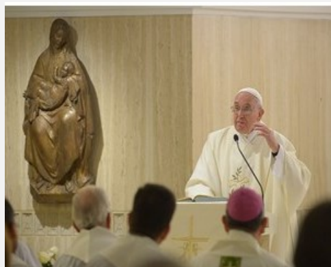
Pope Francis said Mass in the chapel of the Santa Marta residence on Tuesday morning. [Sep. 23, 2014]

... The point is not to hear casually, but to bend our ears