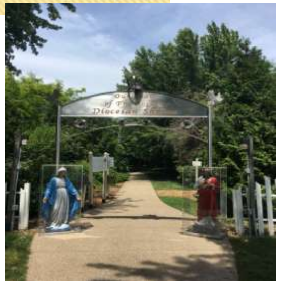
Our Lady of the Rosary Shrine in Merlin, Ontario offers a beautiful garden and walkway with the Rosary and the Stations of the Cross and a walk of the Saints.