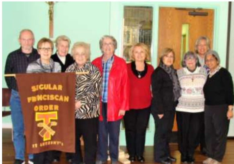
Members of St. Anthony of Padua Fraternity in Brampton taken during a fraternal visit in November 2017.