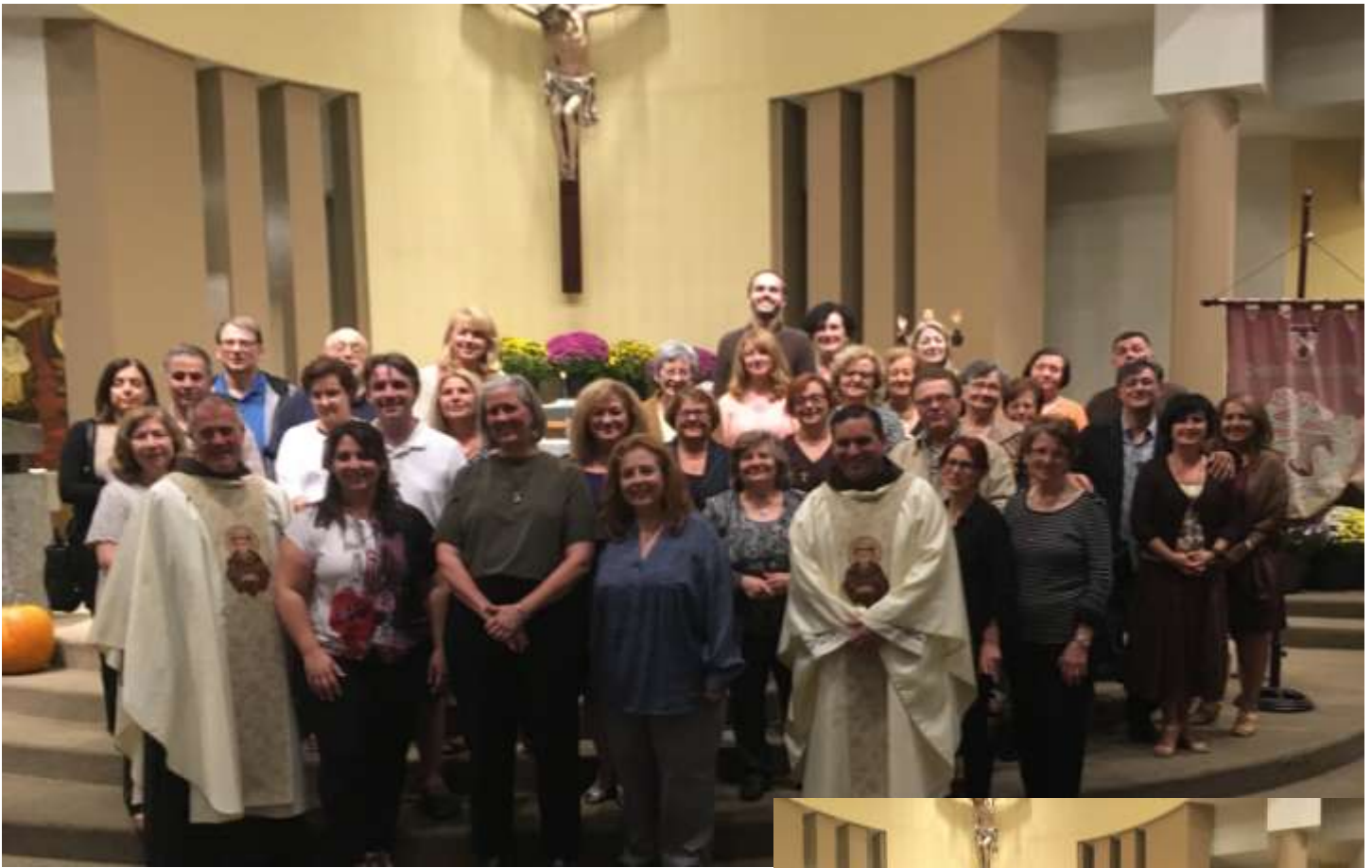
Members of St. Peter's Fraternity, Woodbridge celebrating the Feast of St. Francis and two Professions on October 4, 2017.