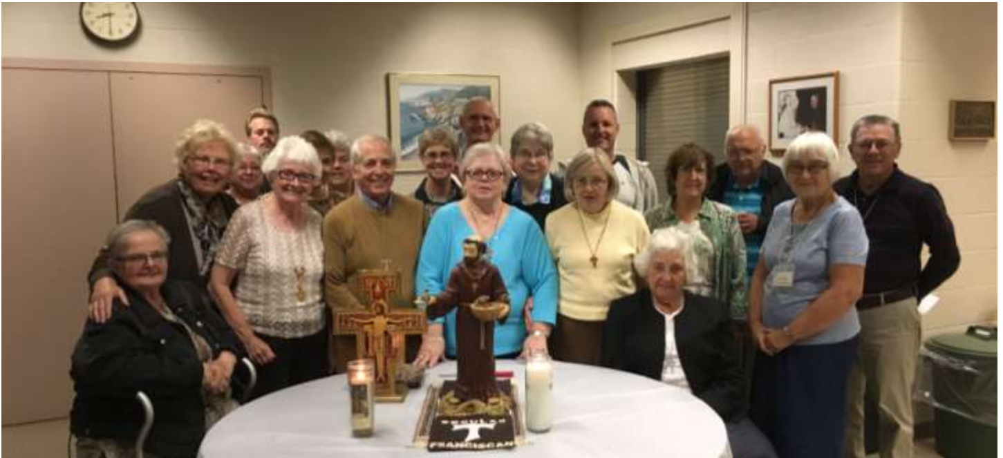
Members of St. Anthony of Padua Fraternity, Sarnia, taken at a visit on October 19, 2017.