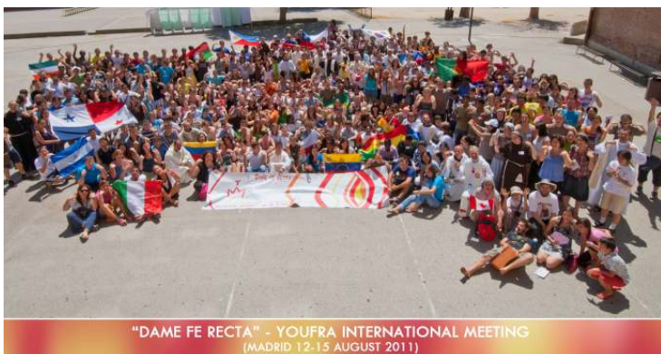
"DAME FE RECTA" - YOUFRA INTERNATIONAL MEETING (MADRID 12-15 AUGUST 2011)